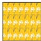
21821 S Yellow Floral