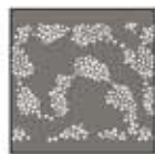
21822 K Gray Abstract Dot