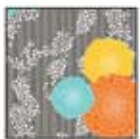
21818 K Large Floral

Approximate Finished Quilt Size: 66" x 86"