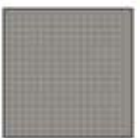
21825 K Gray Dot