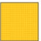
21825 S Yellow Dot