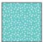
21823 Q Teal Stars