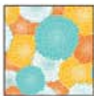
21819 Q Flower Head