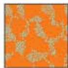
21822 O Orange Abstract Dot