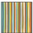
21824 K Stripe