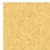
20614-S Blocks and Binding