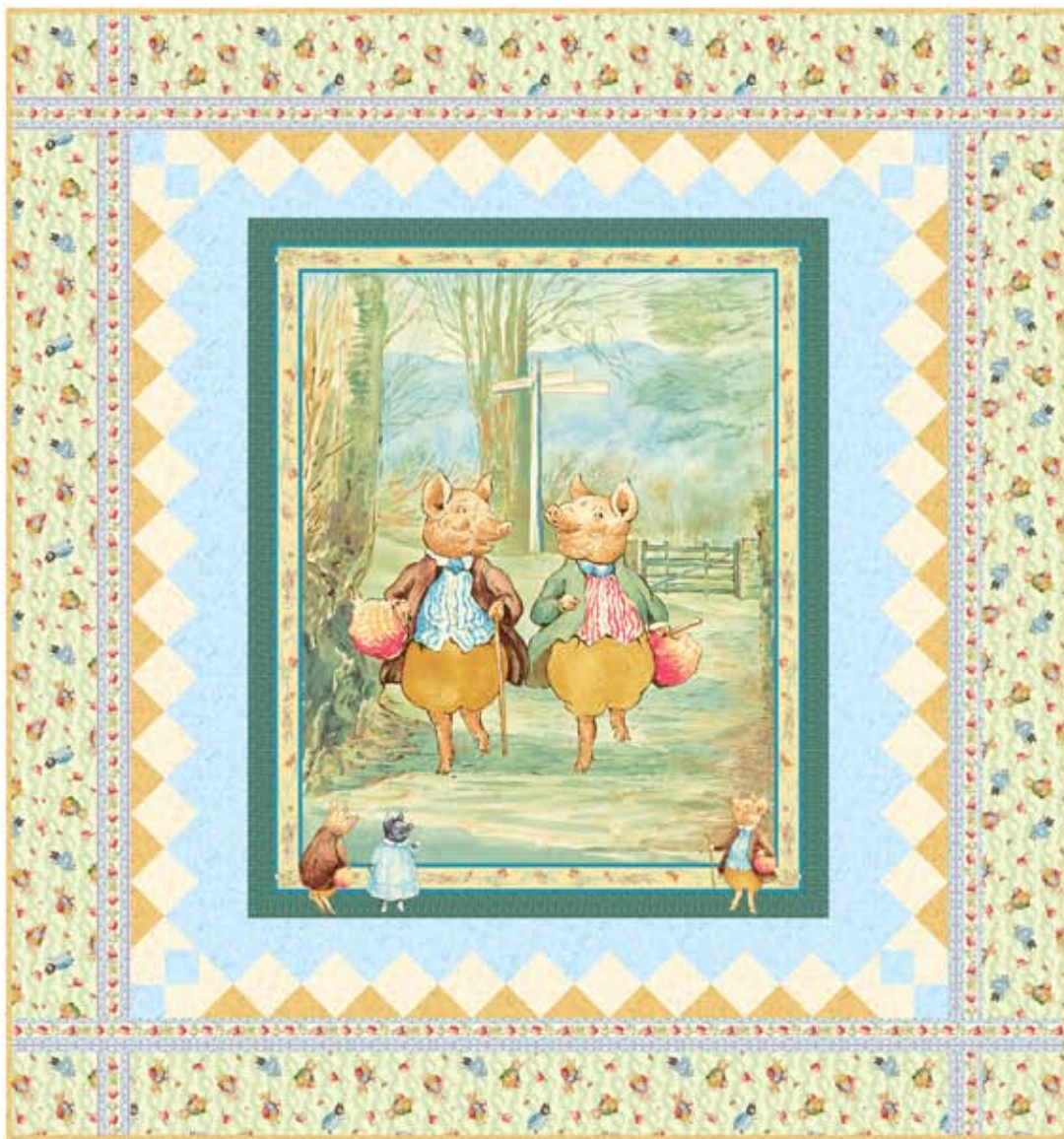
Finished Quilt Size: 62" x 66"