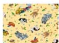
20818-S ¾ yard