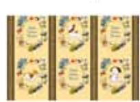
20815-S 1 yard