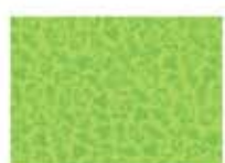
20820-G ¾ yard