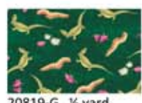
20819-G ½ yard