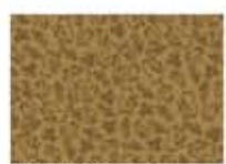
20820-A 1 yard