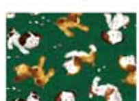
20816-G 3 ¼ yards (Back)