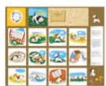
20814-A One Panel