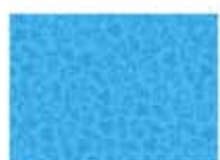
20820-B ¾ yard