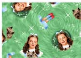
20888 G ½ yd