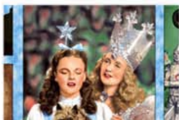
20886 B 1 panel