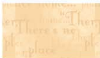
21020 E 2 yds