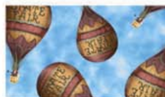
21022 B 4 yds