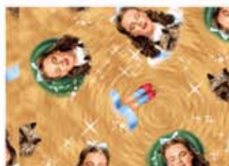
20888 A 1 yd