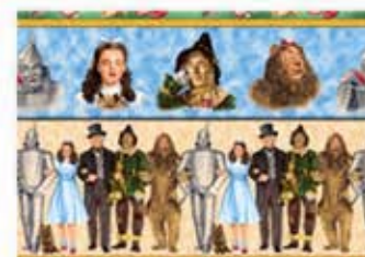
20889 B 2½ yds