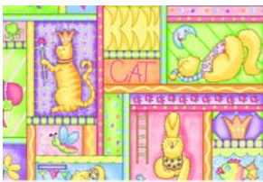
25687 S_P 1/2 yard