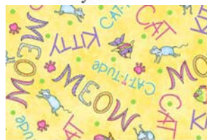
25719-S 2 yards includes backing