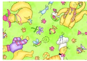
25689 G 1/2 yard plus binding