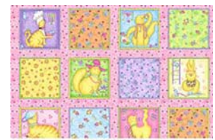
25688 P 3/4 yard