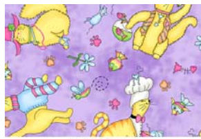
25689-V 1/4 yard