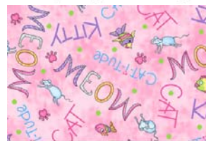
25719 P 1/3 yard