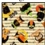
22105 E (inc backing)