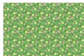
20687-G 1/2 yard