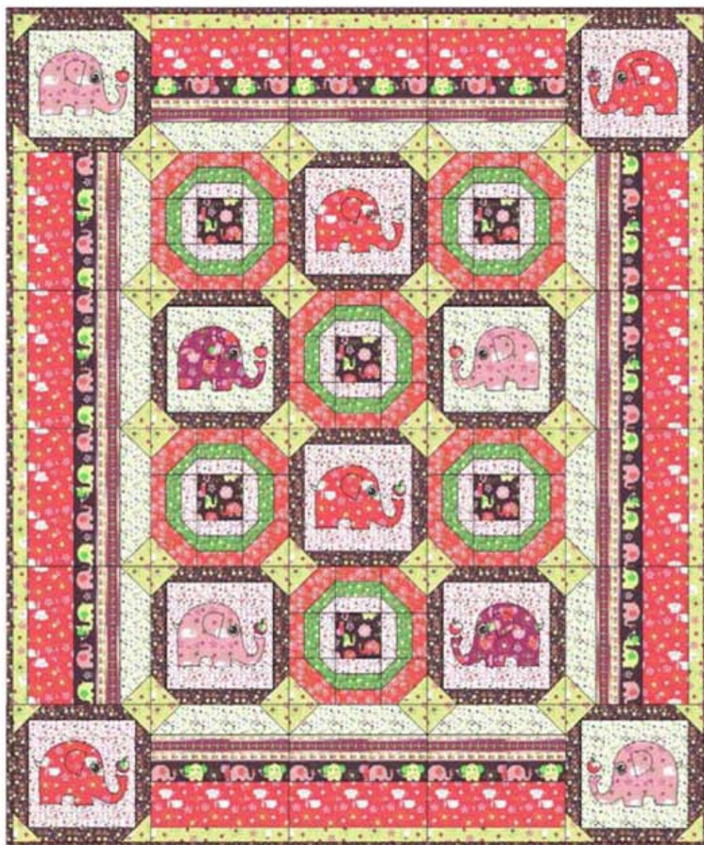
Finished Size: 60" x 72"