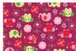
20681-V 1/2 yard