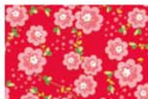
20685-R 3/4 yard