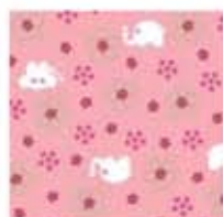
20683-C 1/2 yard