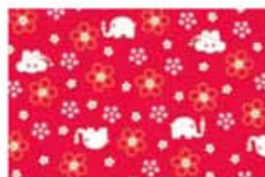
20683-R 1 yard