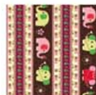
20682-A 1 1/2 yard