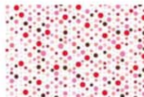
20686-ZR 1 yard