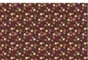
20687-A 1 1/4 yard