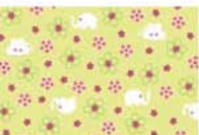
20683-H 1 yard