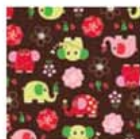
20681-A 1/4 yard