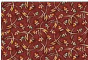
20507-M ½ yard