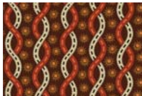
20504-AT ½ yard