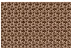
20510-A 4½ yard (includes backing)