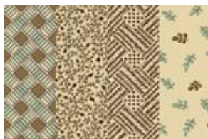
20511-AE 2¼ yard