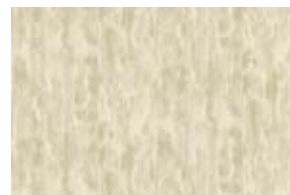
20509-K ½ yard