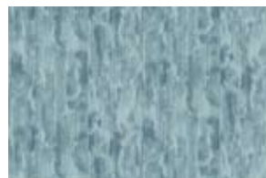
20509-B ½ yard