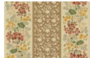
20503-A 2½ yard