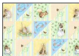
25631-S 1/4 yard