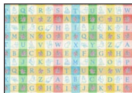
25634-E 3/8 yard