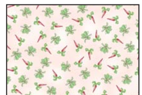
25639-P 3 3/4 yards (includes backing)