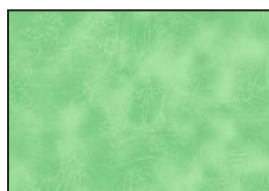
25655-H 1 1/8 yards