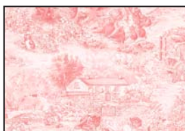
25638-P 1 1/2 yards