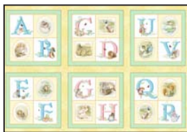
25630-S 1 yard