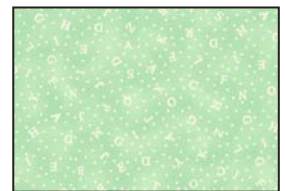
25654-H 7/8 yard