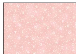
25654-P 1/4 yard