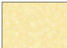
25654-E 7/8 yard