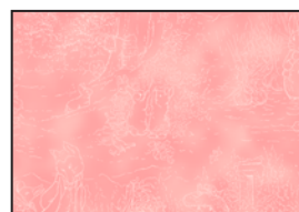
25655-P 1/2 yard