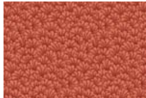
20506-T 1/8 yard