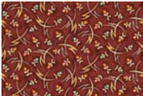
20507-M 1/8 yard