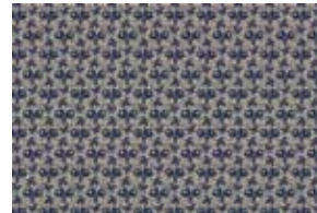
20510-B 3/4 yard