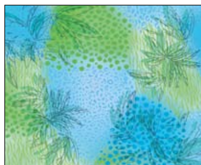
25666-BG 1½ yards