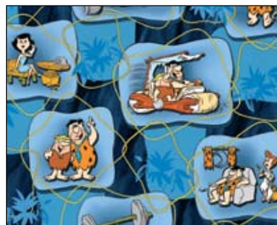
25665-B 1½ yards