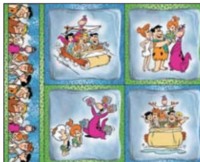
25663-B 1 Panel