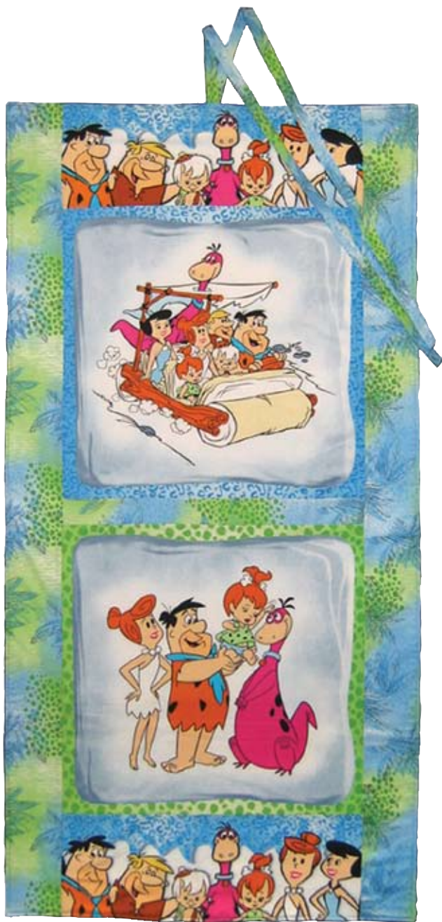
Size: 49" x 23¾"