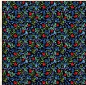
20960 J (relist)