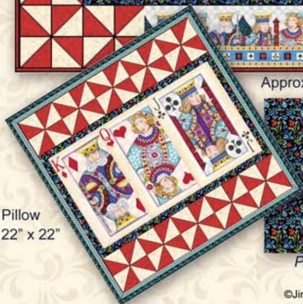
Pillow 22" x 22"