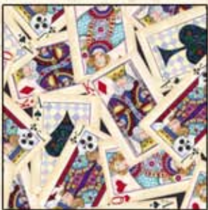
21239 E (backing)