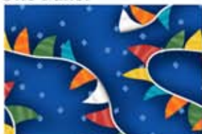
20795 Y 1 3/4 yard