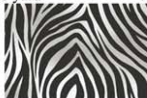
20797 JK 1/4 yard