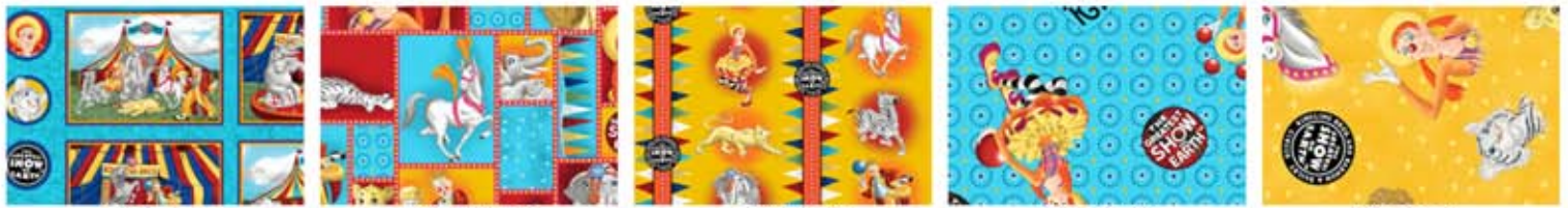
20789 Q One Panel