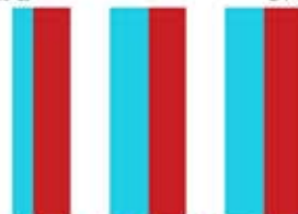
20798 ZQ 1/2 yard