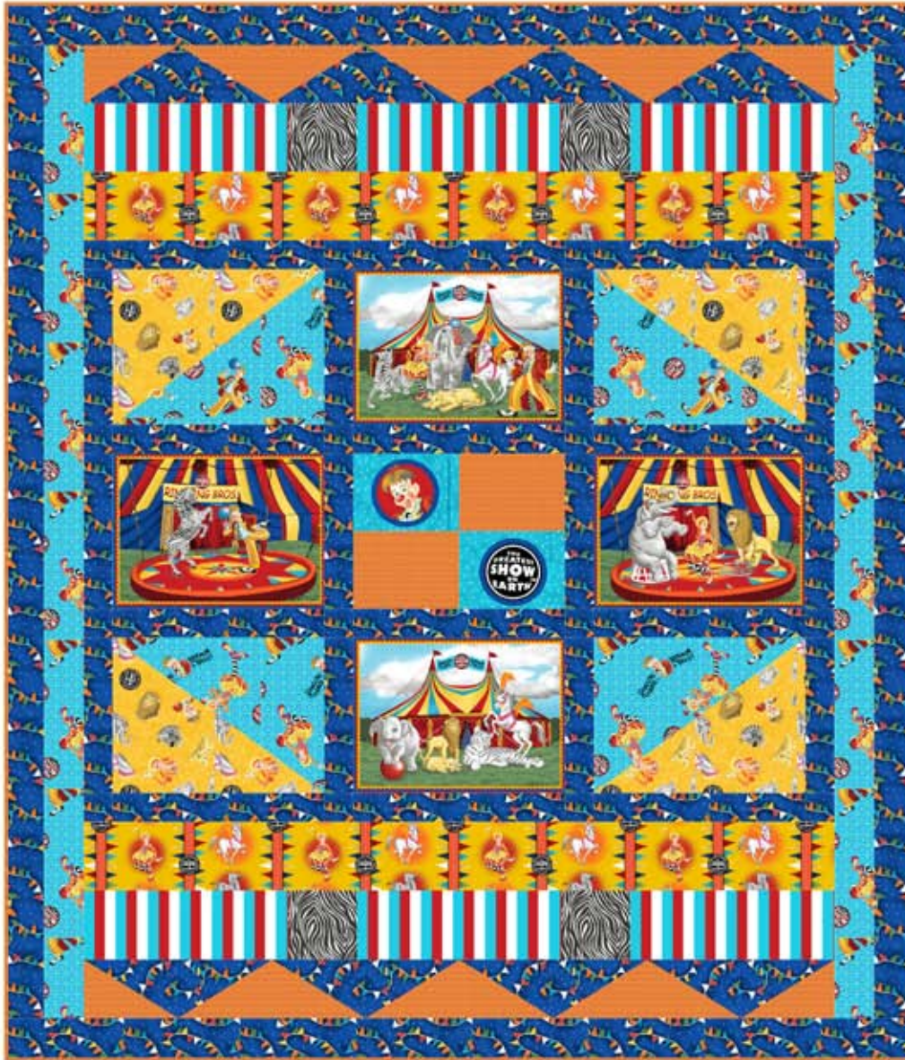
Finished Size: 62" x 73"