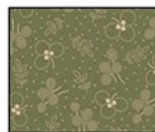
20450-G ½ yard