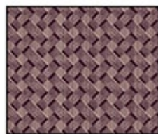
20455-M ½ yard