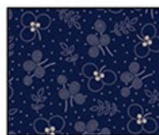
20450-N 5 yards also used for backing