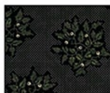
20449-J ½ yard