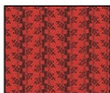
20452-R 1 yard also used for binding