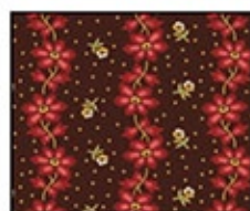
20451-A ½ yard