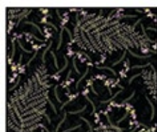
20448-J ½ yard