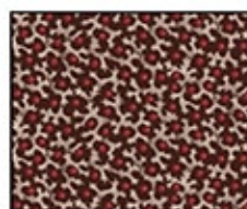
20453-A ½ yard