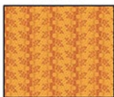
20452-O ¼ yard